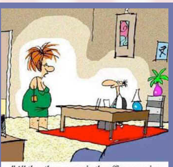
"All the other women in the office are suing you for sexual harassment. Since you haven't sexually harassed me, I'm suing you for discrimination."