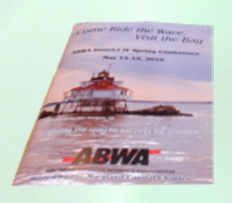
The fruits of the labor of our wonderful Program Committee.